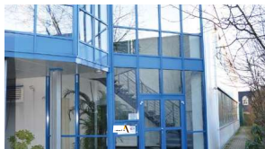
ANDERSON EUROPE GmbH Anderson Europe GmbH, Am Oberen Feld 5, D-32758 Detmold, Germany Tel.: +49 (0)5231 9663-0, Fax: +49 (0)5231 9663-1